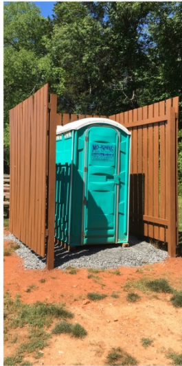
Pole Barn Area