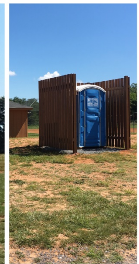
Ball Field Area