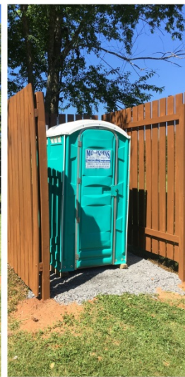
Equine Parking Area