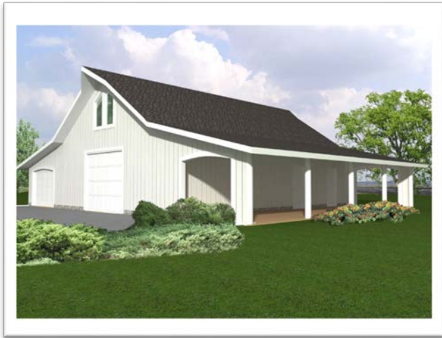
Color scheme pending