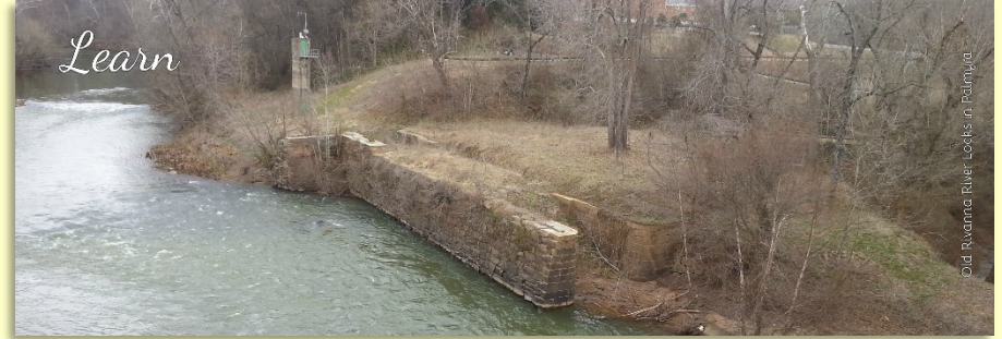
Old Rivanna River Locks in Palmyra