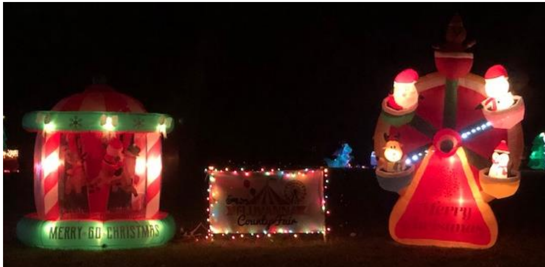
FLUVANNA COUNTY FAIR BOARD