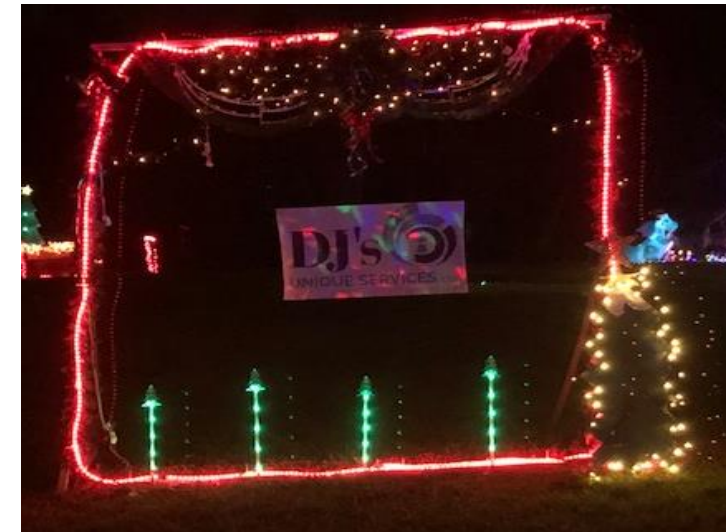
DJ'S UNIQUE SERVICES