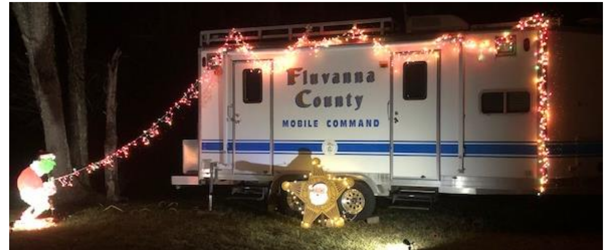
FLUVANNA COUNTY SHERIFF'S OFFICE