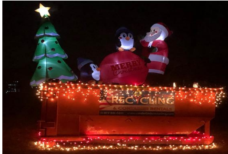
VAN DER LINDE RECYCLING