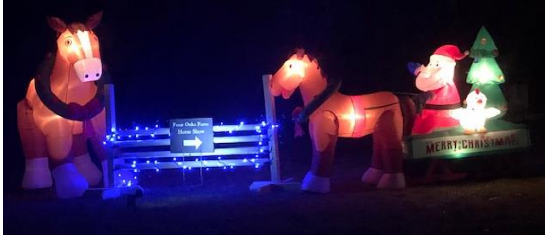
FOUR OAKS FARM