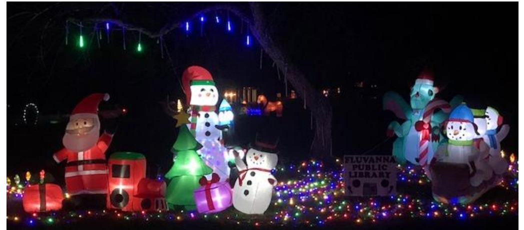
FLUVANNA PUBLIC LIBRARY