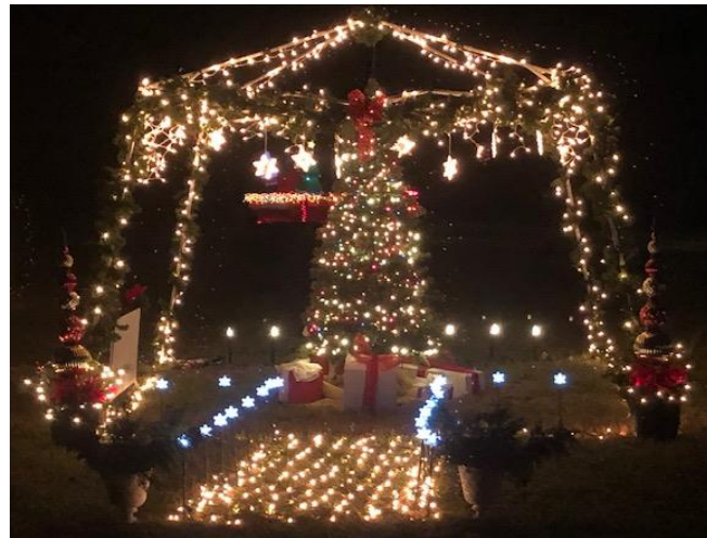
THE ELEPHANT TRUNK