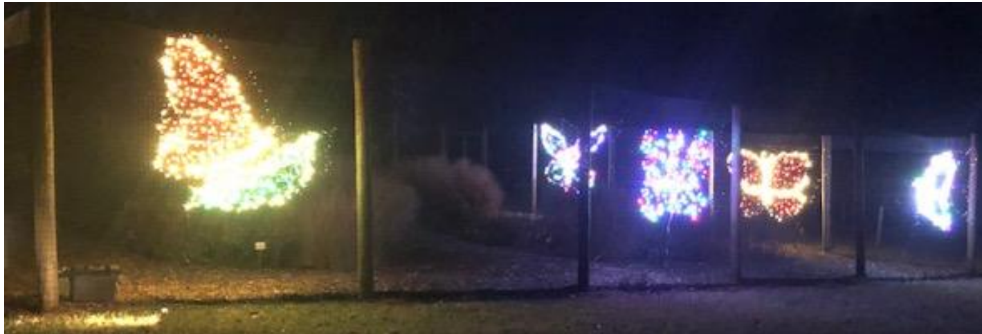
FLUVANNA MASTER GARDENERS