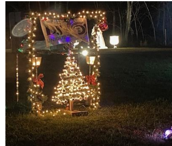
DJ'S UNIQUE SERVICES