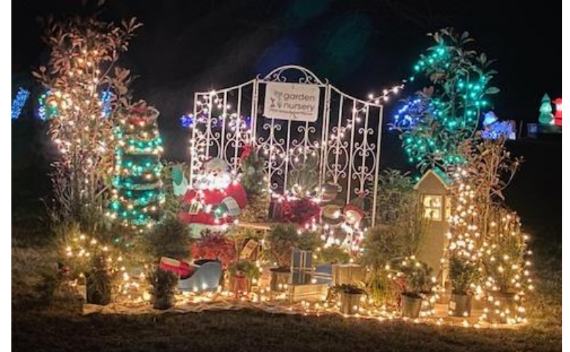
THE GARDEN NURSERY