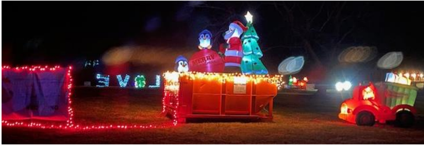
VANDER LINDE RECYCLING