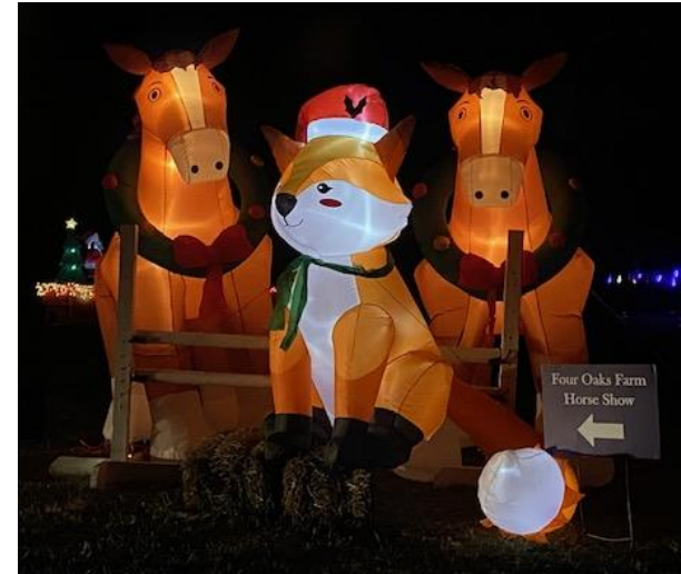
FOUR OAKS FARM