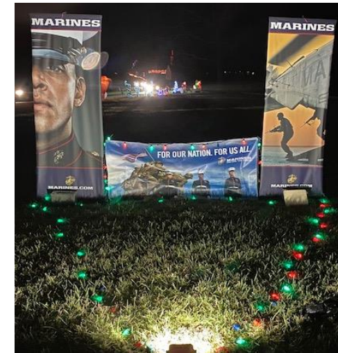
FLUVANNA/LOUISA MARINE OFFICE