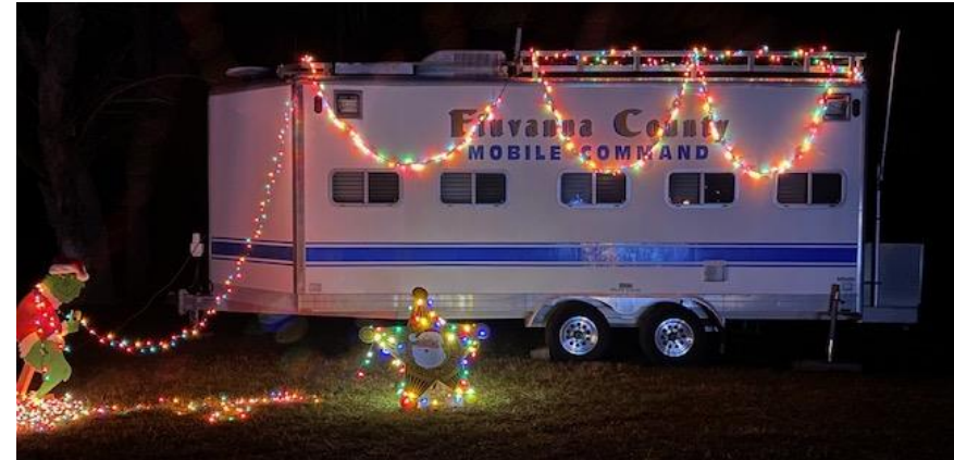
FLUVANNA SHERIFFS DEPARTMENT