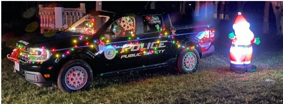
LAKE MONTICELLO PUBLIC SAFETY