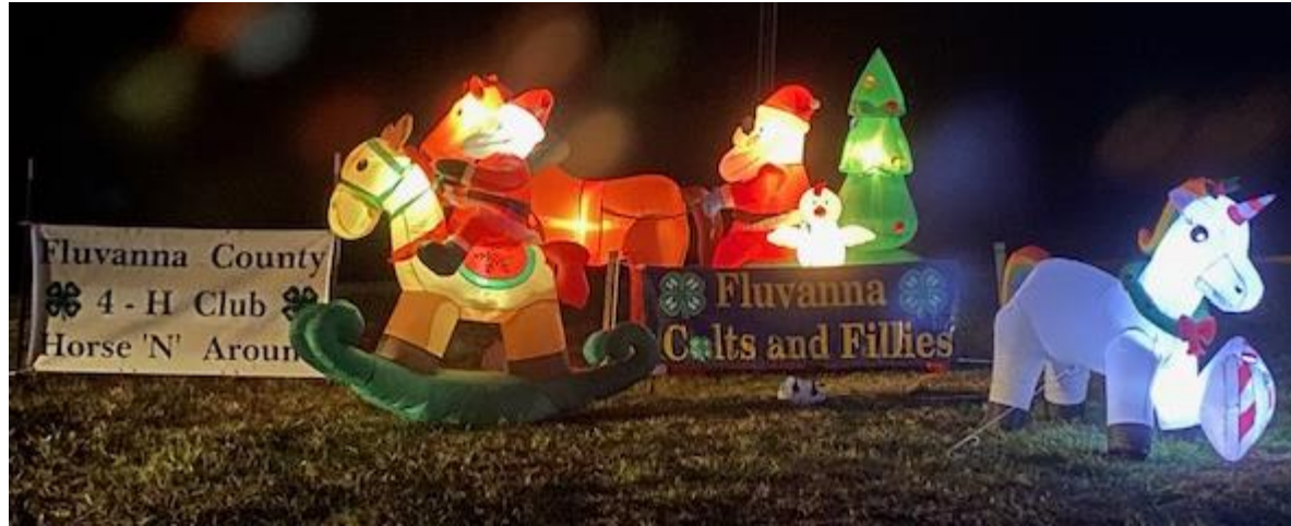
FLUVANNA 4-H CLUB