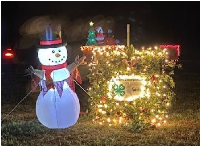
FLUVANNA EXTENSION OFFICE