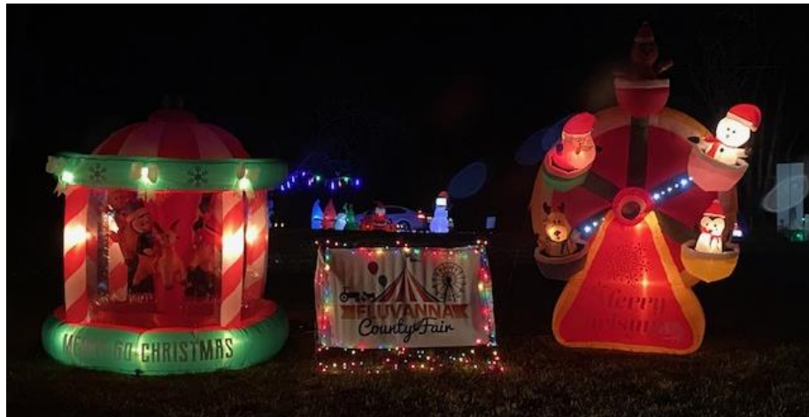
FLUVANNA COUNTY FAIR