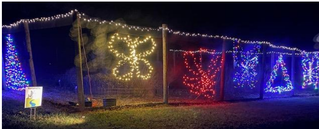
FLUVANNA MASTER NATRUALIST