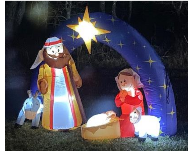
EFFORT BAPTIST CHURCH