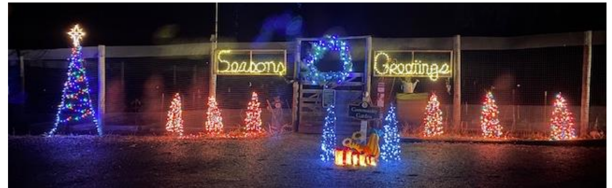
FLUVANNA COMMUNITY GARDEN