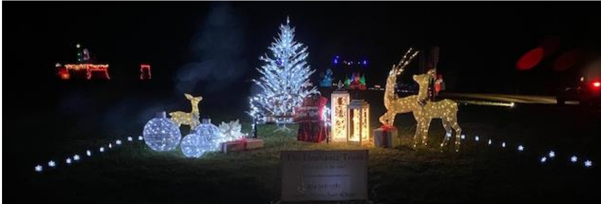
THE ELEPHANTZ TRUNK