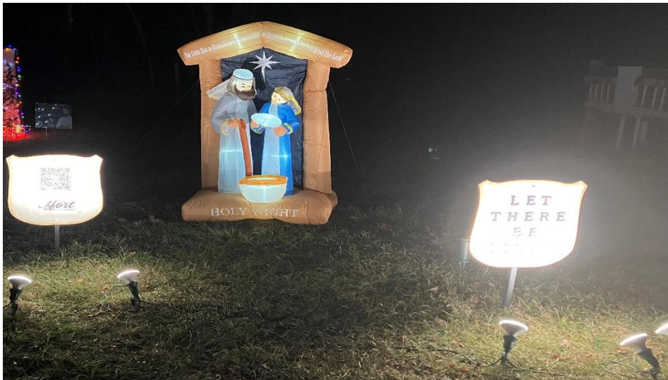
EFFORT BAPTIST CHURCH