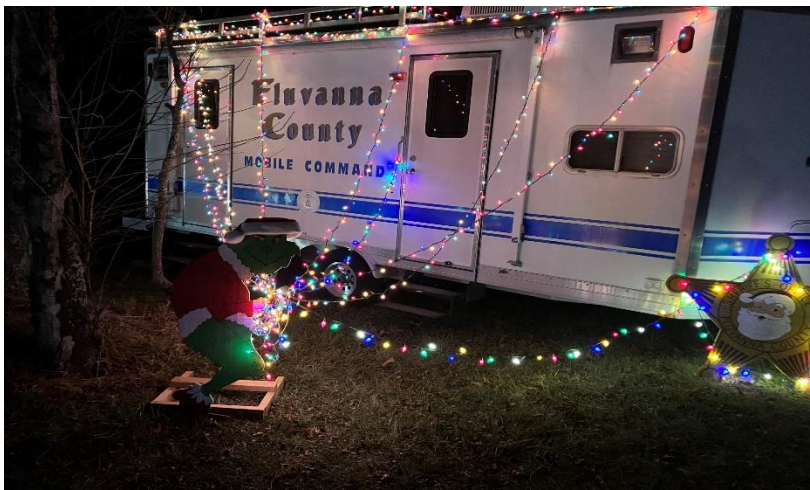
FLUVANNA SHERIFFS DEPARTMENT