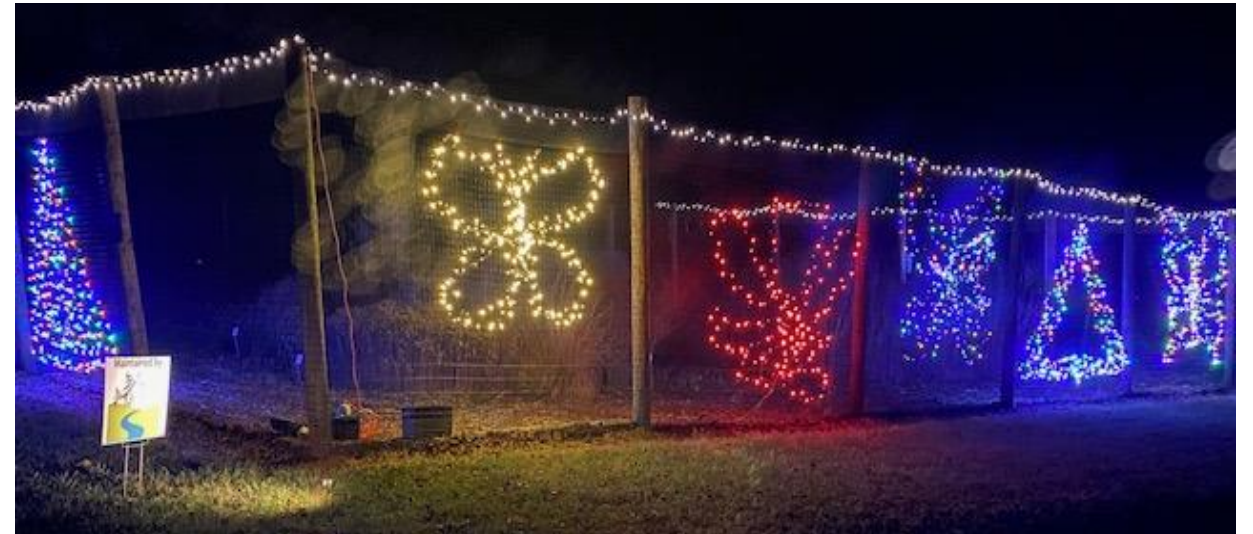
FLUVANNA MASTER NATRUALIST