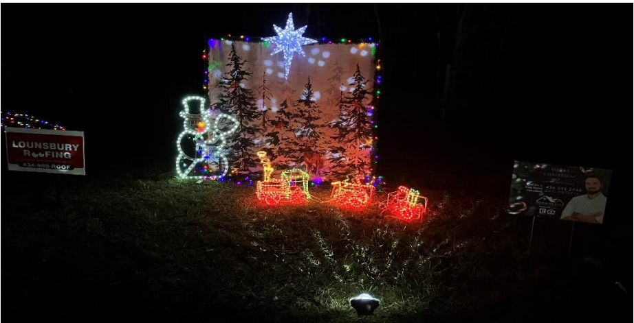
LOUNSBURY ROOFING & TOWN REALITY