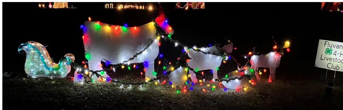
FLUVANNA 4-H LIVESTOCK CLUB