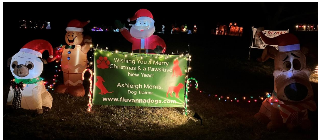
ASHLEIGH MORRIS; DOG TRAINER