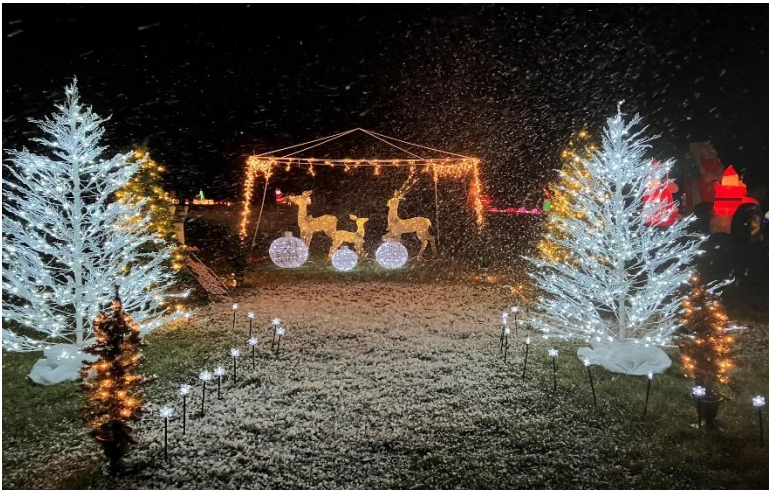
THE ELEPHANTZ TRUNK