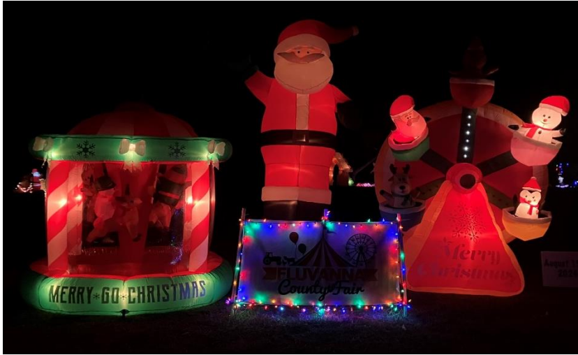
FLUVANNA COUNTY FAIR