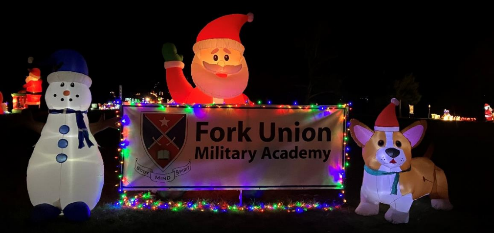
FORK UNION MILITARY ACADEMY