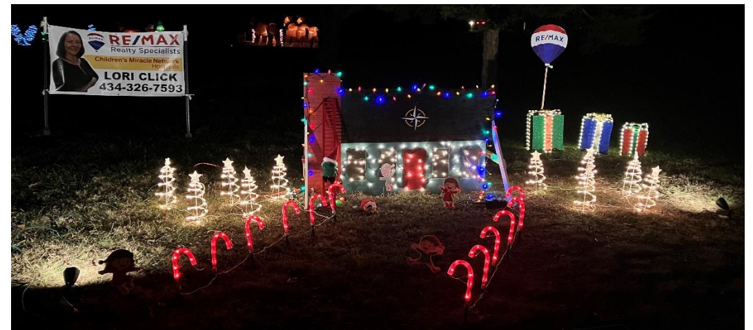
LORI CLICK; RE/MAX REALTY