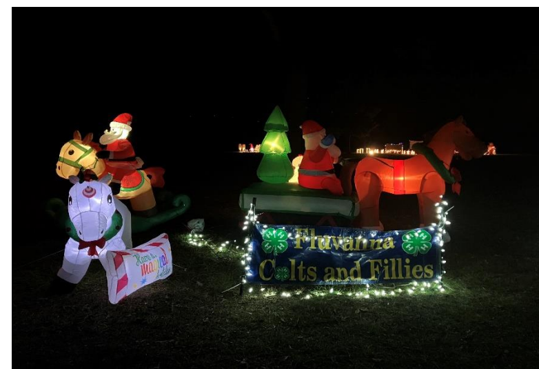
FLUVANNA 4-H CLUB