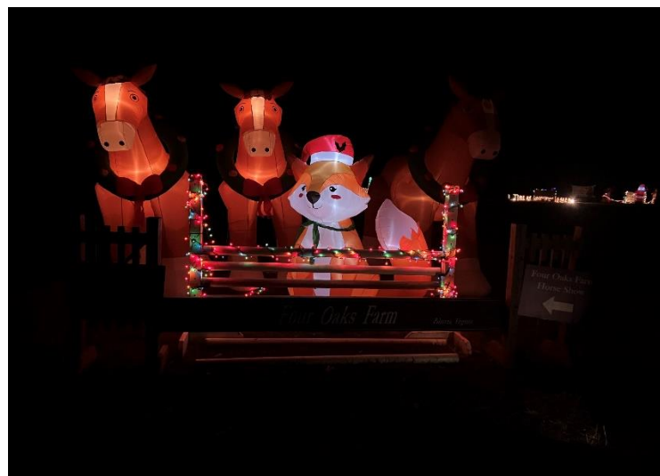
FOUR OAKS FARM