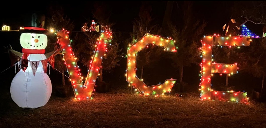
FLUVANNA EXTENSION OFFICE