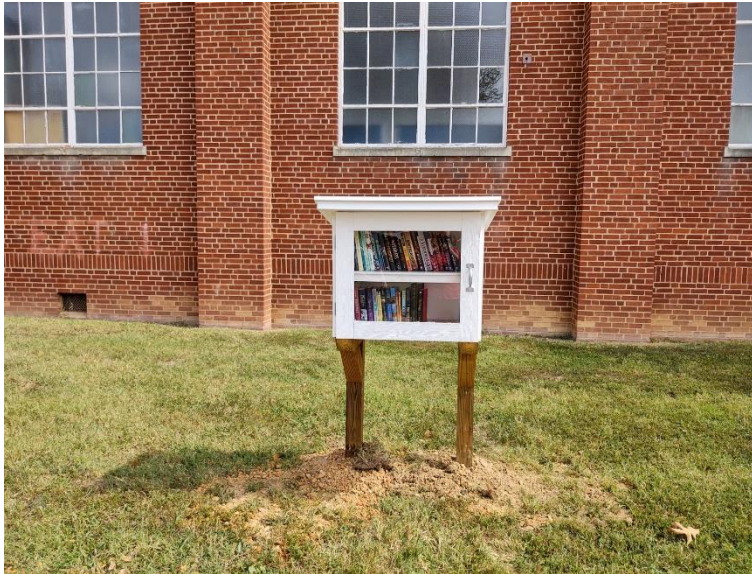
Girl Scout Silver Award Troop 1106 “Little Library at Carysbrook Gym”