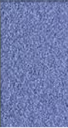
Current Contract Includes “Steel Blue” (Depicted)