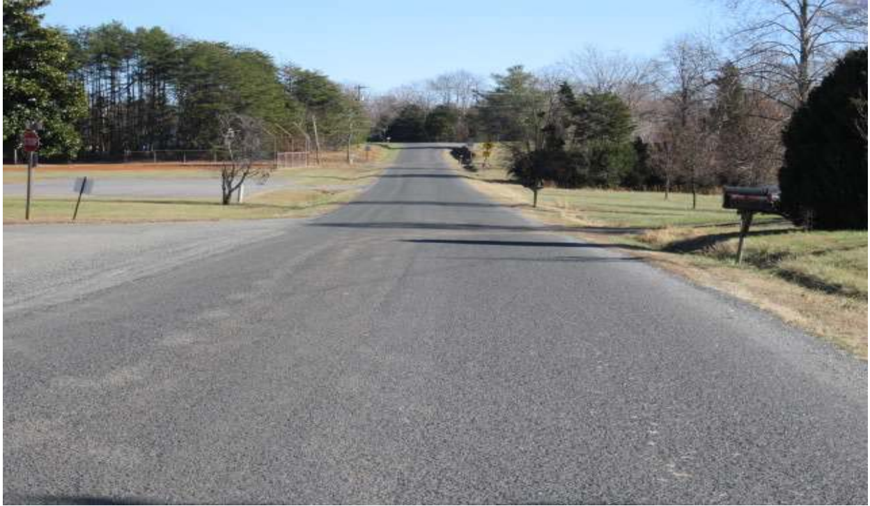
Street Scene: Camera facing east along Cunningham Rd. Subject on left.