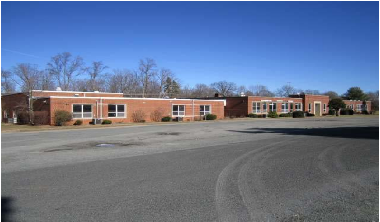
Camera facing northeast toward the front and left side of subject building.