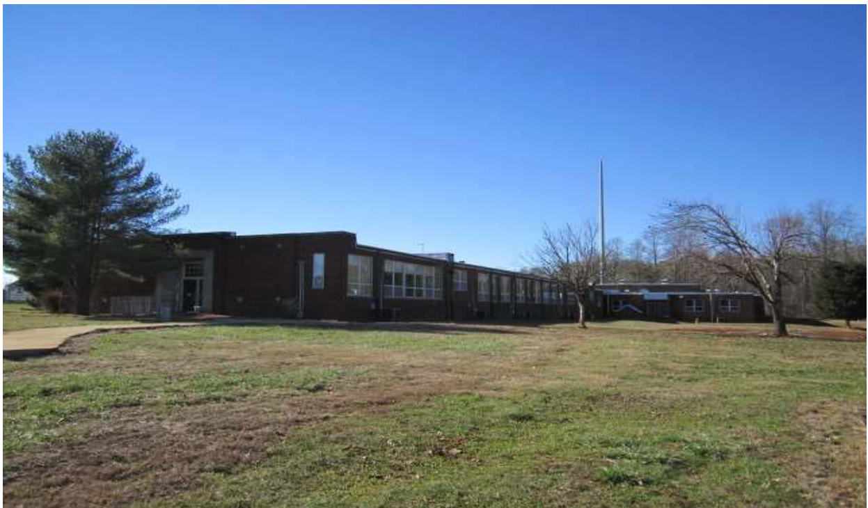
Camera facing southwest toward the rear and right side of subject building.