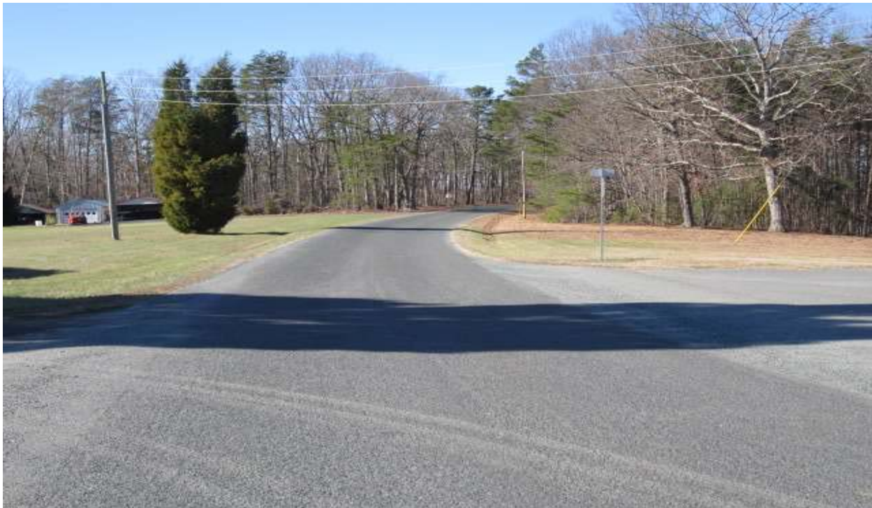
Street Scene: Camera facing west along Cunningham Rd. Subject on right.